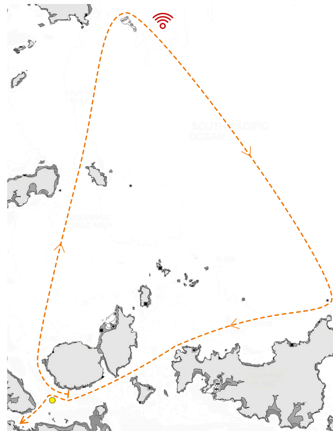
COURSE 5: Safety at Sea 100 Course (64nm)

Reply MARK 1 to SSANZ Text message after passing and/or rounding Motuora Island